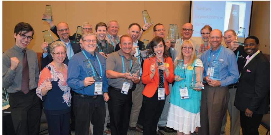
Christian Retailing's Best winners celebrate their wins in Cincinnati.

B&H Publishing Group was the runaway winner with 13 awards, while Abingdon Press won five. Lighthouse Christian Products and Baker Publishing Group took home four awards each.